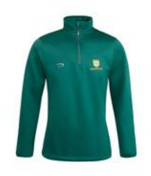
Squadkit Thermotex Midlayer Top