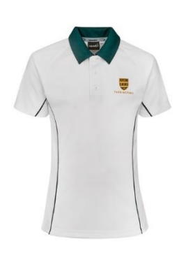
Squadkit Hydrocool Lite White Polo Shirt