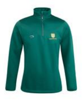
Squadkit Thermotex Midlayer Top