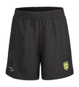
Plain Black Skort or PE Shorts