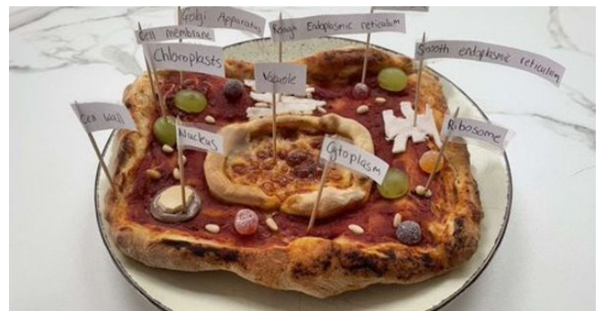
Well done to Laura - KS3, Ava - KS4 and Rianna - KS5 for winning the Biology Pizza Competition. Pupils were asked to create a pizza cell by using different toppings, with some amazing results! Well done everyone.