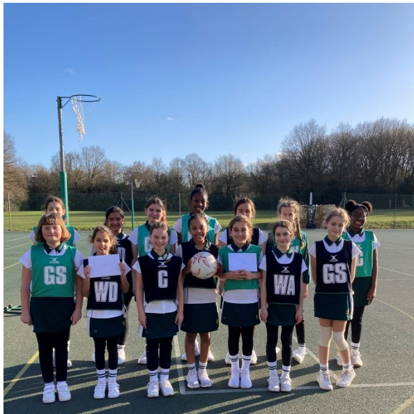
Congratulations to all the players in the Farringtons U11 Netball Tournament.