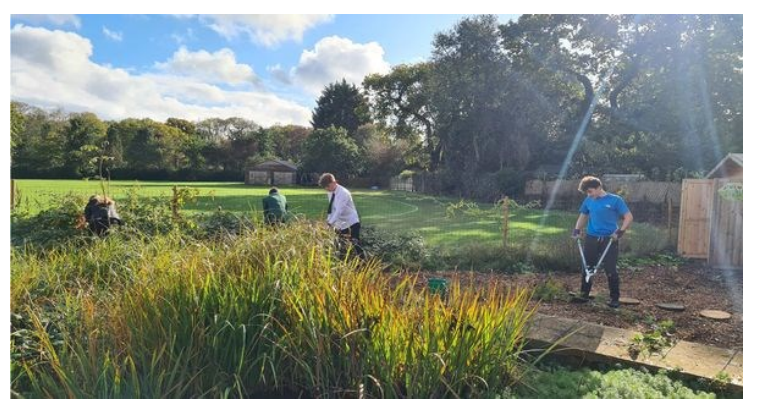
Year 10 enjoyed getting their hands dirty during their Floreat Goes Green lessons.