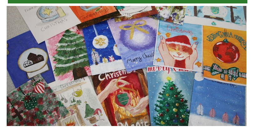
Thank you and congratulations to everyone who entered the annual Christmas Card Competition.