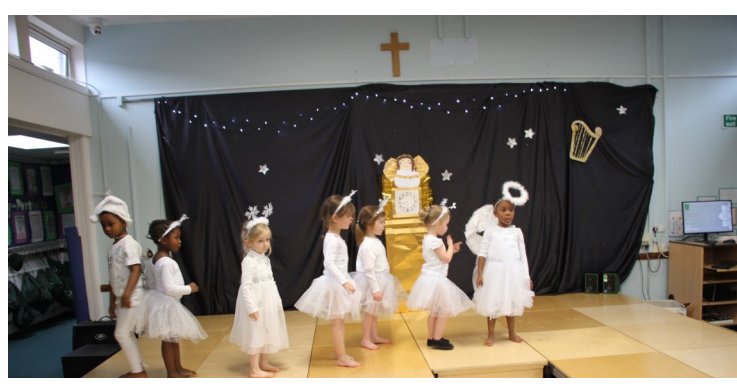
Parents were 'wowed' with the impressive performances of the children in their nativity Whoops a Daisy Angel .