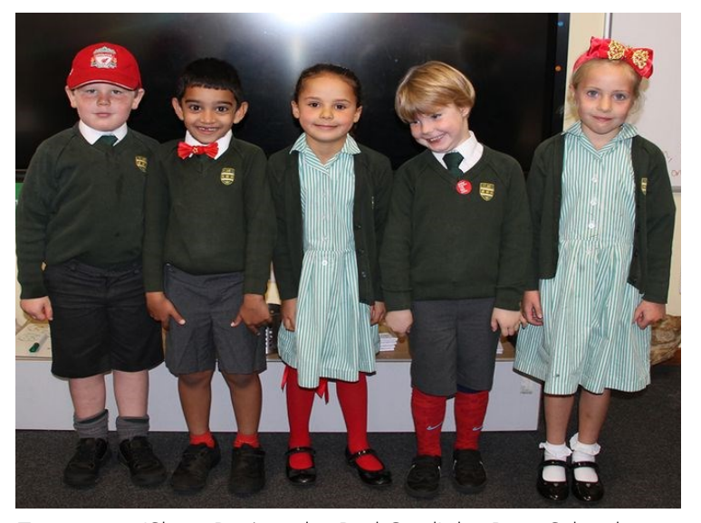
To support 'Show Racism the Red Card' the Prep School wore a piece of red clothing to school.