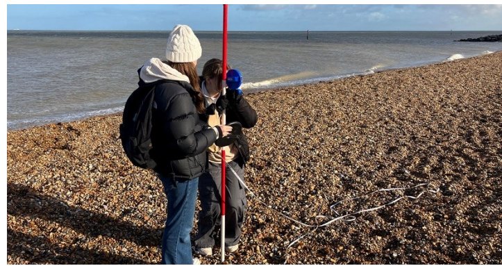
The Sixth Form had a great trip to Reculver Bay in Kent as part of their Geography fieldwork on beach profiles.