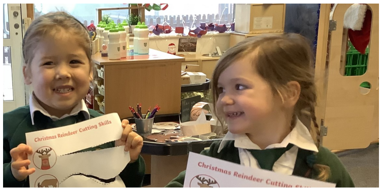
Pre-Reception children had fun improving their fine motor skills with Christmas themed activities.