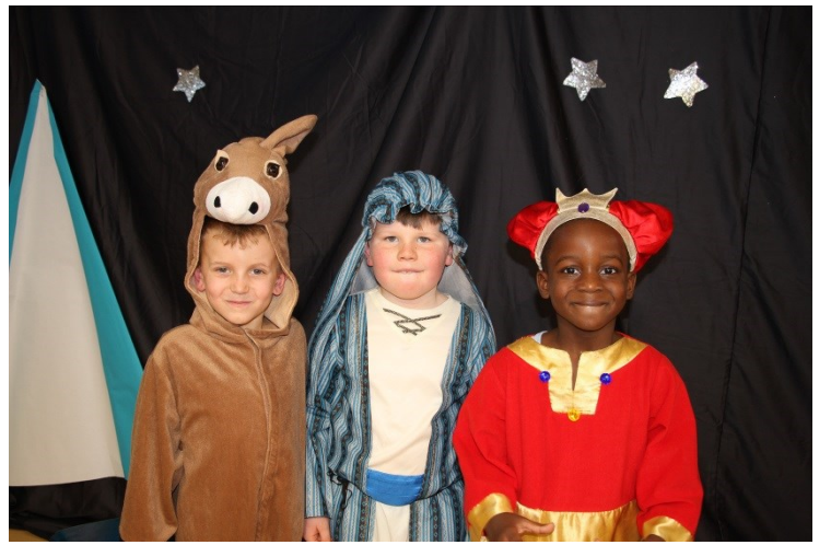
There was great excitement this week as our KS1 pupils performed their nativity to family and friends.

Well done to all the children who performed confidently and had great fun. We thought that they were fabulous!