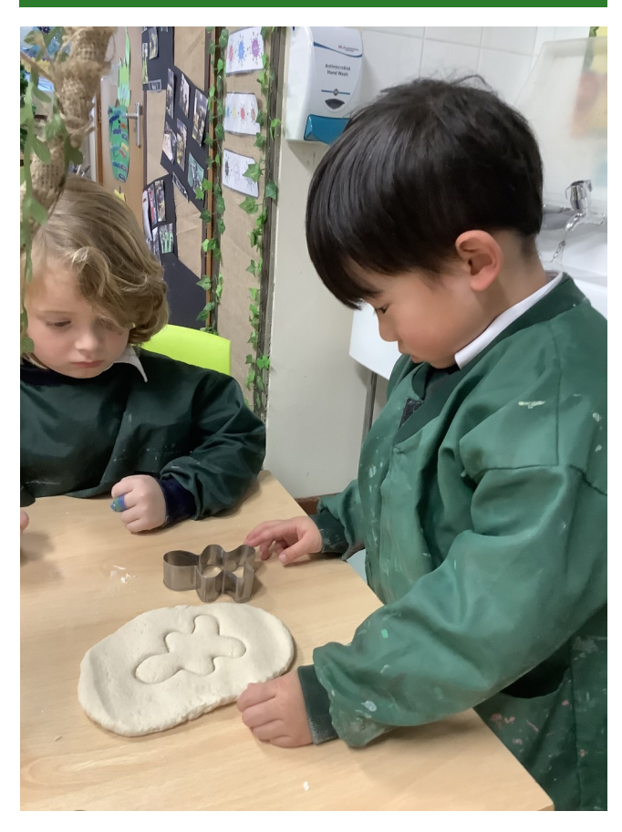
Pre-Reception children loved getting messy making salt dough Christmas decorations.