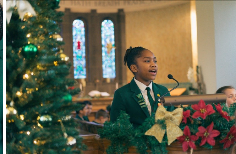
Congratulations to all the Key Stage 2 pupils for their wonderful singing and readings at their Christmas Carol Service.