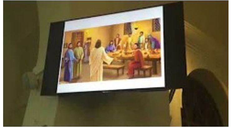
Click here for the Junior Chapel Service