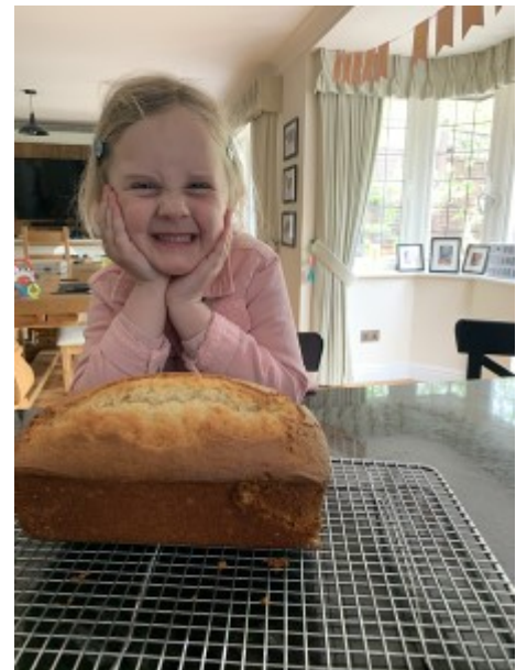
Rose pleased with her end result