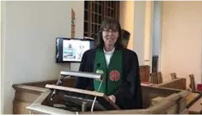
Click here for the Senior Chapel Service