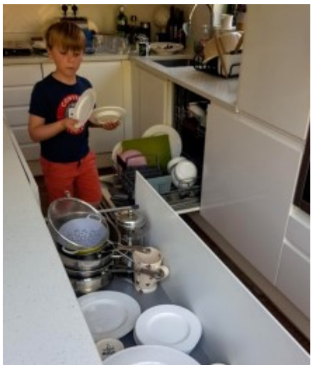
Willoughby helping out in the kitchen