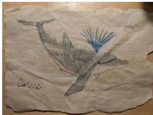
Yana's picture of a dolphin on tea stained paper