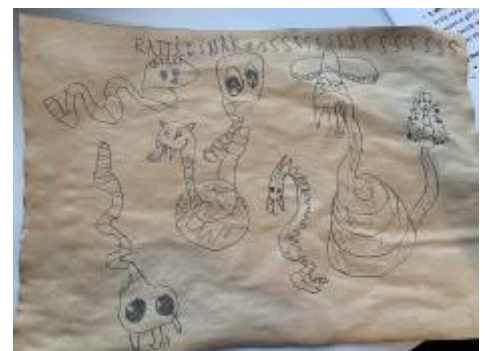
Elliot's rattle snake drawing