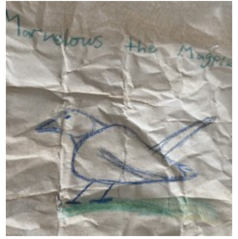
Ava's picture on tea stained paper