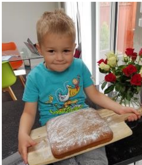
Gherman's 123 cake