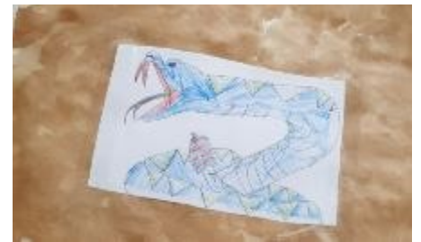
Gabriel's rattle snake picture