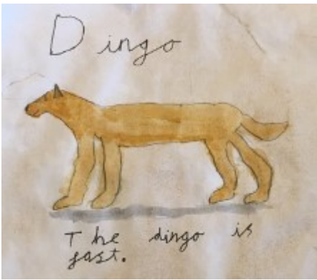
Eva's Dingo drawing