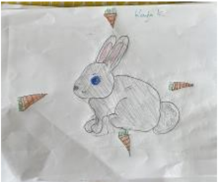
Kayla's rabbit drawing