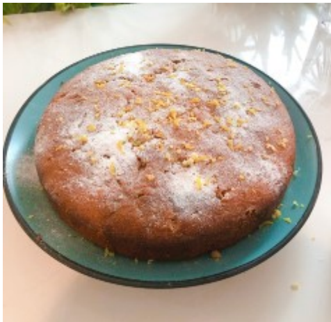
Dhyaan's delicious cake