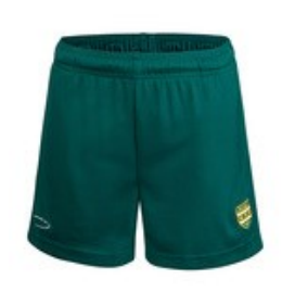
Squadkit hydrocool lite green crested PE shorts*