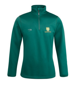
Squadkit thermotex midlayer green crested top*