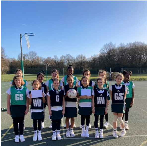
Congratulations to all the players in the Farringtons U11 Netball Tournament.