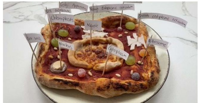
Well done to Laura - KS3, Ava - KS4 and Rianna - KS5 for winning the Biology Pizza Competition. Pupils were asked to create a pizza cell by using different toppings, with some amazing results! Well done everyone.